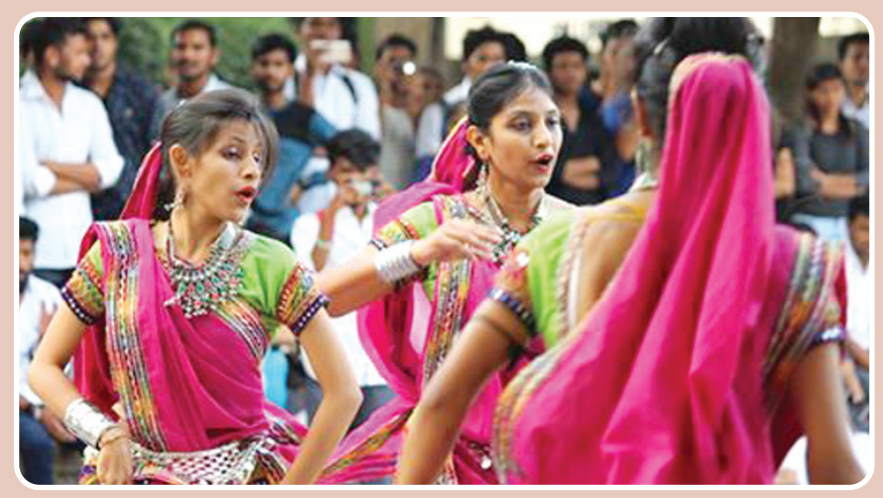
नवरात्रि में आईपीएस एकेडमी कैंपस धर्मिक हो उठा है. नवरात्रि के नौ दिनों तक विद्यार्थियों में उत्साह रहा. एकेडमी में शाम ४ से ६ ( सभी विद्यार्थियों के लिए ) व रात्रि 8 से 10 हॉस्टल गर्ल्स स्टूडेंट्स के लिए गरबा आयोजित किया गया।