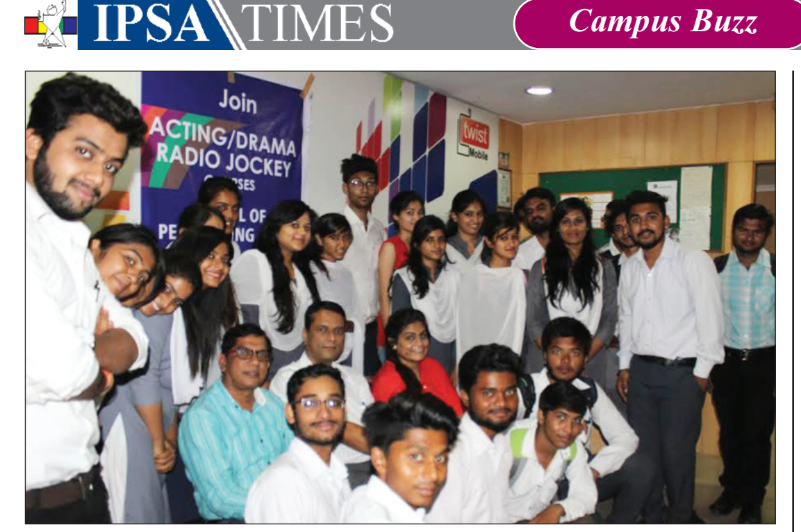
Students of mass comm at IPSA studio for practical training.