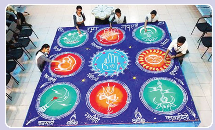
Beautiful rangoli designed by the students of the School of Fine Arts.